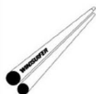
460 SDM Mast