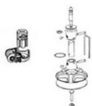
Base and Joint